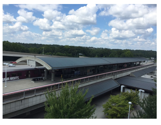
7010 Peachtree Dunwoody Road Sandy Springs, GA 30328

North Springs Station is a heavy rail rapid transit station located in the northern part of Fulton County on MARTA's Red Line. It is located between Peachtree Dunwoody Road and Georgia 400, with station entrances off of each. In addition, there is a pedestrian bridge and a pathway to the station from an adjacent multifamily apartment community. North Springs Station provides rapid rail transit service to major destinations including the Buckhead shopping and business district (11 minutes), Midtown (23 minutes), Downtown (27 minutes), and Hartsfield-Jackson International Airport (43 minutes). Additionally, five bus routes currently serve North Springs Station, providing access to and from surrounding cities.